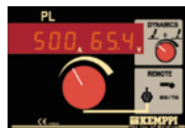
PL control panel

The Kemppi Pro Evolution control panels for MMA welding include many useful features, such as automatic hot start, automatic arc dynamics, and anti-freeze features.