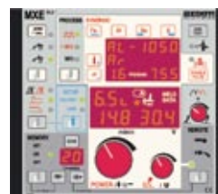
MXE control panel