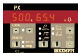
PX control panel