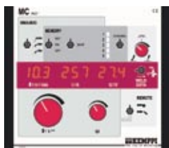
MC control panel