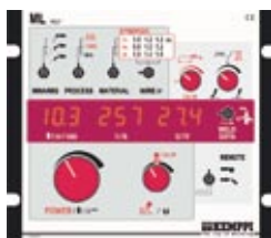
ML control panel